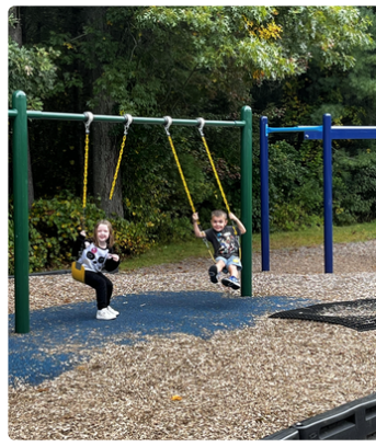
Kindergarten Fun at Recess