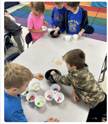
Stations in Kindergarten